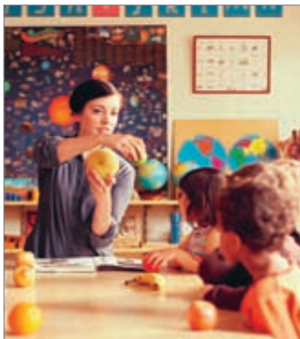
A teacher explains how the Earth moves

Lärarförbundet's support for people's right to education goes beyond its own borders and is carried out in collaboration with teachers' unions in other countries. At the Dakar meeting in 2000, Sweden was among the countries that promised to contribute the necessary funding to deliver EFA. Sweden is performing well in