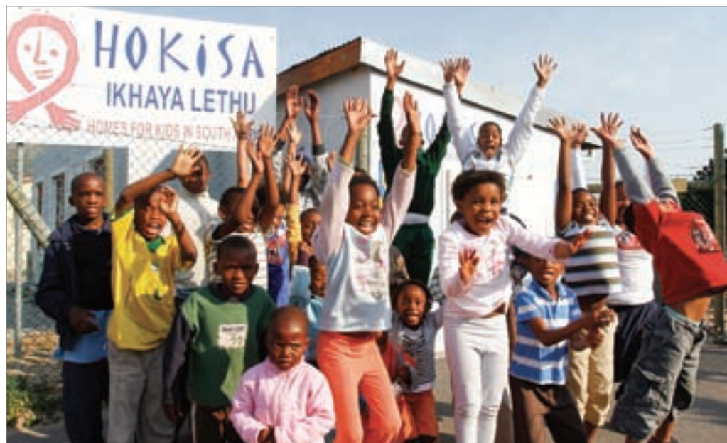
HOKISA gives orphaned children a safe ‘family’ life

The nurturing continues as the children grow older. Once they reach an age where they can live independently as responsible adults, they have the chance to move into ‘Peace House’, which is also in Masi, and where HOKISA staff offer support and friendship. The oldest child has now grown up, is living independently in Peace House and has been trained to be a home-based carer. He is fully employed and is giving back to the community that supported him.