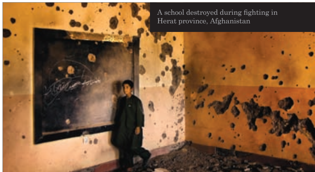
A school destroyed during fighting in Herat province, Afghanistan