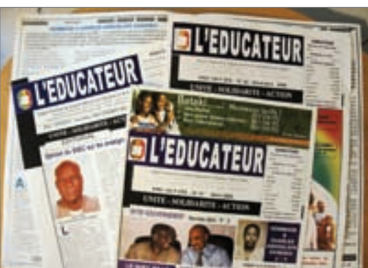
The new SNEC magazine

At the turn of the new millennium, two EI member organisations, the OAJ and UNSA-Education embarked on a development co-operation project with an EI counterpart in Mali – the Syndicat National de l'Education et de la Culture (SNEC).