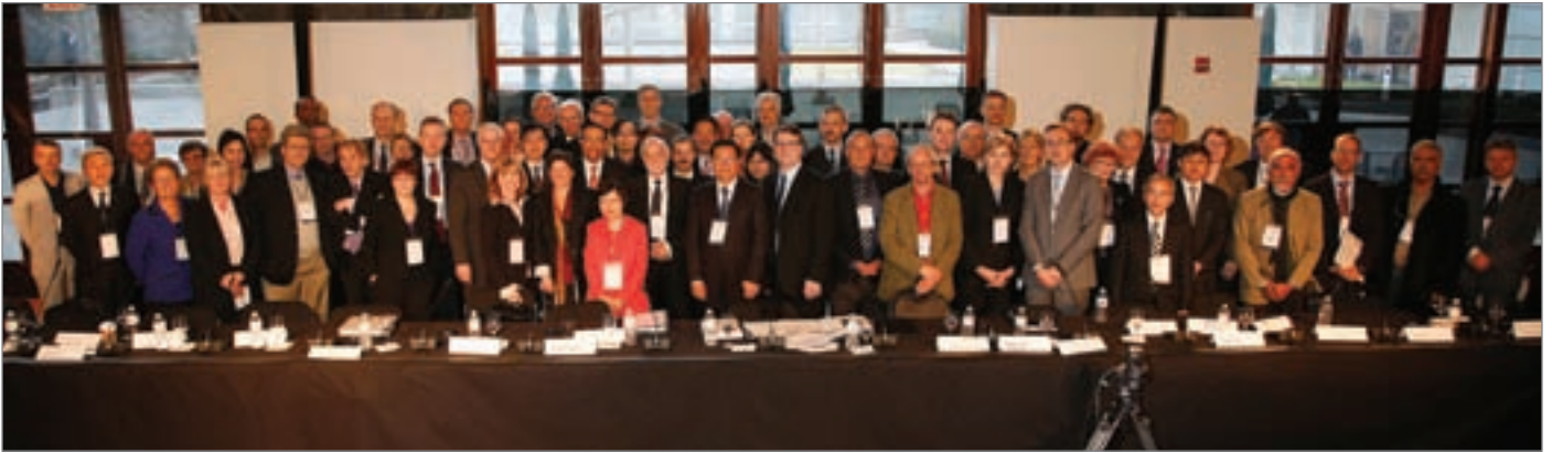
Education ministers and trade union leaders assemble in New York

included because it did not meet the OECD's criteria of 'high performing and rapidly improving education systems'. This decision was regretted because Sweden's approach to teacher involvement and its pay system was continually referenced in the OECD's background paper. Organisations such as the ILO and World Bank also attended the Summit.