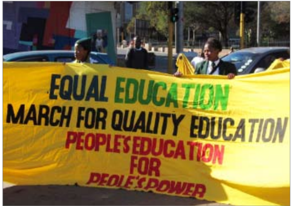
South African education activists demand more investment in education

Equal Education has also supported teachers' demands for decent wages. During the strikes in 2010, the organisation arranged pickets to call on the government to meet teachers' demands so that learning could be resumed. Despite the fact that students did not benefit from the absence of their teachers, it was understood that better teachers' pay would lead to a better education system in the long-run.