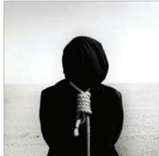
'Anonymous' from Sudan is a human rights defender featured in Kerry Kennedy's book

In September 2010, the NYSUT and Kennedy Centre announced the 'Challenge to End Child Labour' initiative where school children were challenged to fight child labour in the cocoa industry in West Africa. Hundreds of participants in the challenge were recognised at the 10 December launch event, which showed the film The Dark Side of