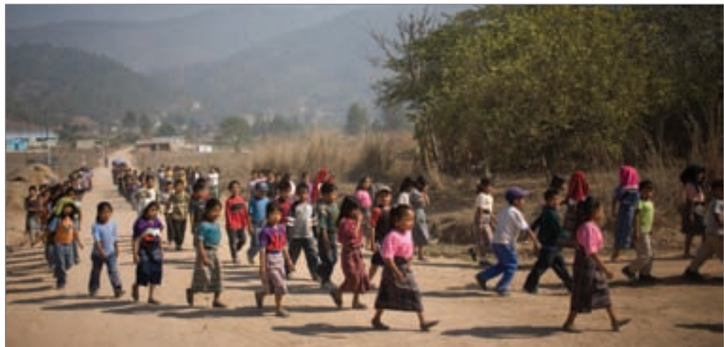
Children walk to their rural school in Xicalcal village in Guatemala

Teachers have played a key role in the fight for freedom in Guatemala. The strikes held by teachers and university students in the capital in 1944 triggered the 'October Revolution', which overthrew the de facto government and led to the first democratic elections in the country's history. A period of change began, during which STEG was created,