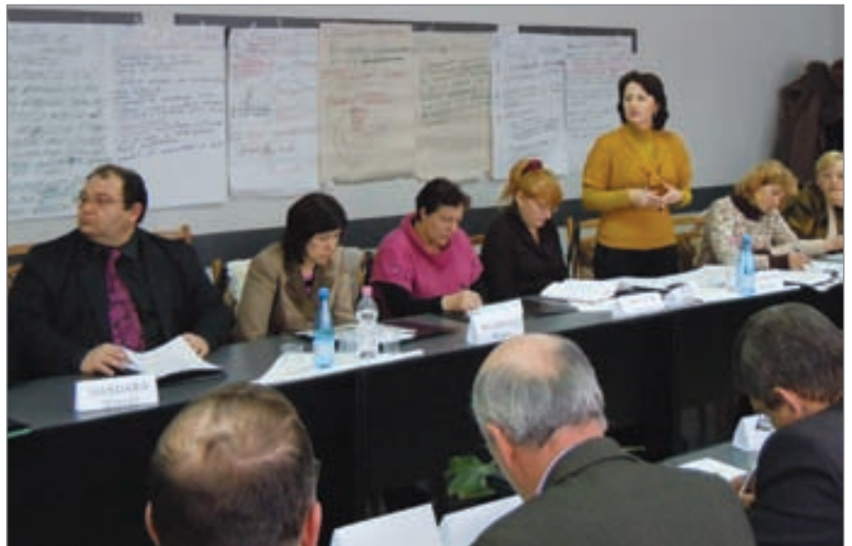
Participants discuss collective bargaining skills during a seminar in Chisinau

The 25 participants that took part in the training responded with thought-provoking and insightful feedback to the items discussed during the sessions. They recognised that industrial relations do not yet function properly in their country, and that the Union needs to intensify its efforts to lobby at different levels of local and national structures in order to promote good partnership. They also concluded that one of the first steps