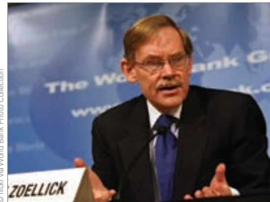
World Bank President, Robert Zoellick

Standardised testing and the publication of league tables that normally accompany results-based measures focus on quantifiable lower order cognitive skills, ignoring qualitative higher order skills that are difficult to measure or test. The publication of league tables may also generate competition rather than co-operation among teachers and schools. Education